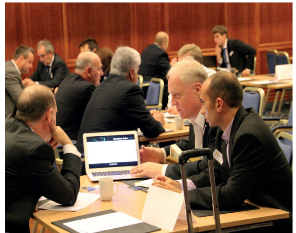
Meeting between Spanish and Norwegian companies celebrated in October, 2012

country, the CDTI acts as a management body, charged with design and financial management according to applicable regulations. As for the Donor Countries, they are represented through Innovation Norway, an entity under the umbrella of the Norwegian Embassy, which renders advisory and networking services. Furthermore, as a national focal point and in order to ensure the fulfilment of objectives, the Ministry of Finance and Public Administrations oversees the financial mechanism, performing tasks that certify, audit and coordinate the implementation and monitoring of the Programme.