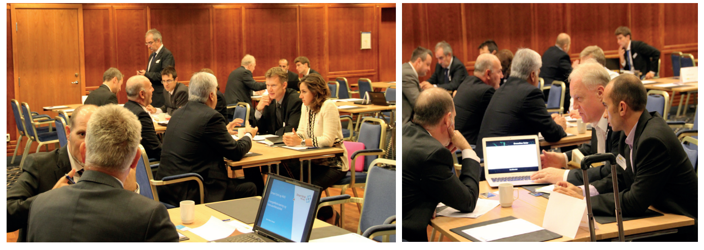
Meeting between Spanish and Norwegian companies celebrated in October, 2012

country, the CDTI acts as a management body, charged with design and financial management according to applicable regulations. As for the Donor Countries, they are represented through Innovation Norway, an entity under the umbrella of the Norwegian Embassy, which renders advisory and networking services. Furthermore, as a national focal point and in order to ensure the fulfilment of objectives, the Ministry of Finance and Public Administrations oversees the financial mechanism, performing tasks that certify, audit and coordinate the implementation and monitoring of the Programme.